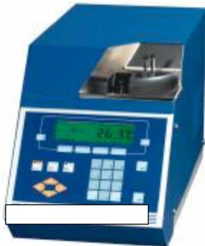
FIG. A1.3 Automatic Mini Method Cloud Point Apparatus