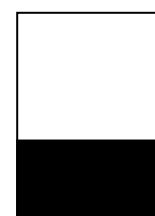
1/3 Page Horizontal

Live matter intended to print must be positioned in accordance with the live area spec of the ad.