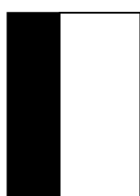
1/3 Page Vertical