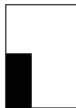
1/6 Page Vertical