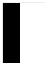
1/3 Page Vertical