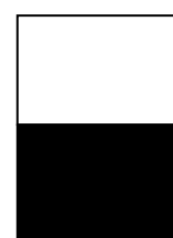
1/2 Page Horizontal